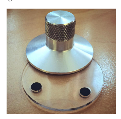
Figure 6 . Components of the current prototype widget utilising conductive plastic contact points.

In the final iteration the shape of the rotary fader or other tactile device will be used to allow differentiation between the widgets, without the need for visual cues. The current prototype features contact points made from an Acetol based conductive polymer and an aluminium knob body shown in figure 6.