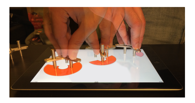
Figure 3. Turnector prototype widget in use