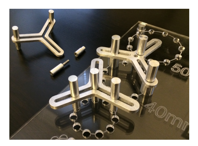
Figure 4 . Prototype widgets in a calibration jig.

Active widgets were dismissed early on in the development process due to the hardware complexity involved. Experimentation thus began with conductive materials to simulate touchpoints. Firstly, a stylus was investigated and it was noted that the soft tip was not recognised until pressure was applied that increased the area of contact. Contact area was obviously a critical factor so an investigation into the smallest recognisable contact point was undertaken. Aluminium was machined to create different size contacts for testing. This material was used as it is easy to machine and is an adequate conductor. For the purpose of the investigation, circular contact points were used for ease of machining and because they approximately represent the elliptical contact shape of a finger. Contacts with a diameter of 2-10mm (+/- 0.05mm) in 1mm increments were created and tested on the screen. It was found that a contact point smaller than 5mm diameter was not detected; with the use of a screen protector a contact point of at least 6mm was required.